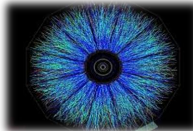
High Energy Physics