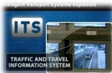
Intelligent Transportation Systems