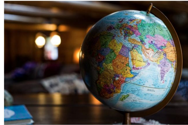
Regional Initiatives and Alignment