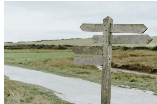
Metadata and Vocabularies