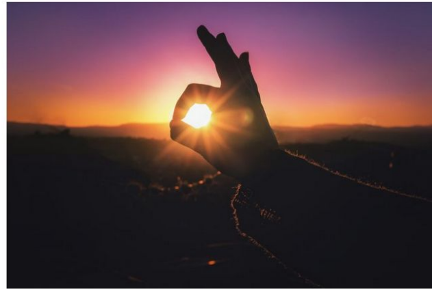
Next Generation Repositories