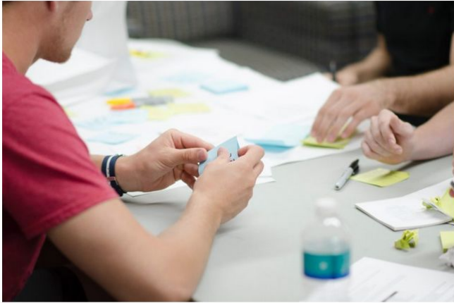
Training and Capacity Building

COAR Confederation of Open Access Repositories