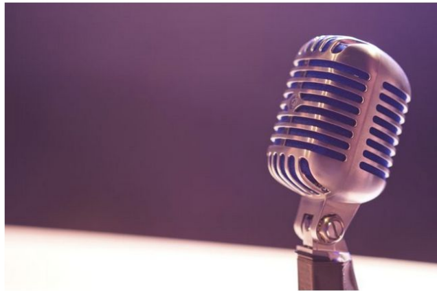
Our Collective Voice