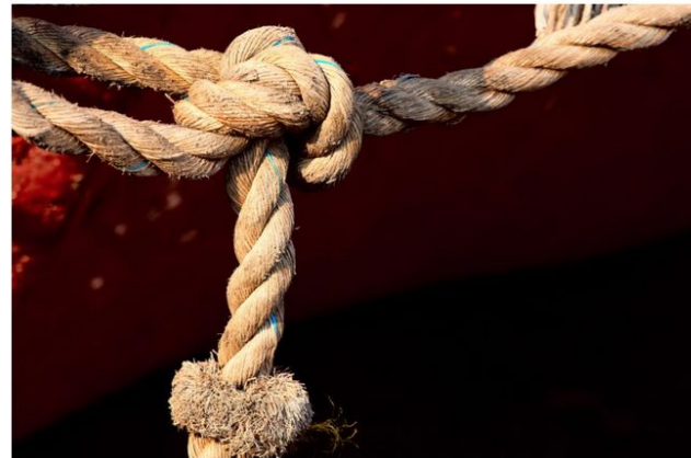
Repositories and Publishing